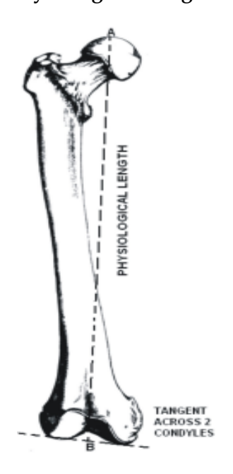
Fig. I. Figure showing measurement of Physiological Length

Sagittal Diameter of Middle of Shaft: It measures the distance between the anterior and posterior surfaces of the bone, approximately at the middle of the Shaft i.e., the most prominent part of the linea aspera or two points farthest apart in sagittal plane at mid-shaft